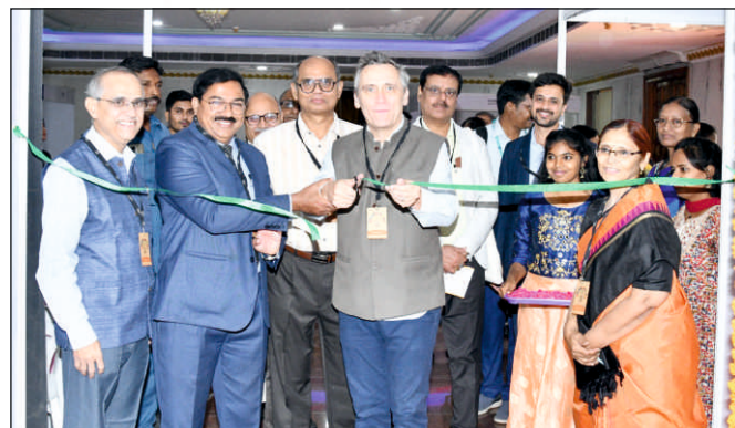
Deputy high commissioner of British inaugurating the exhibition at workshop