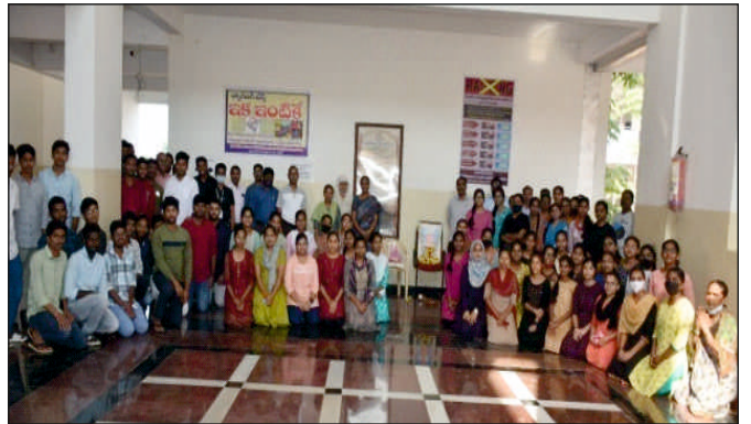
National Youth Day Celebrations at Agricultural College, Jagtial