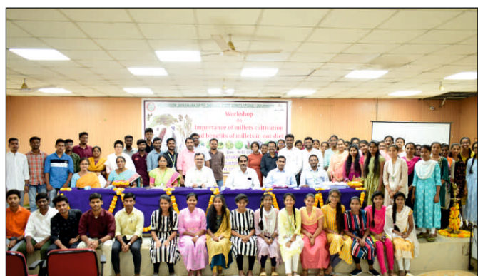
Workshop on importance of Millets at RARS, Jagtial on account of IYOM