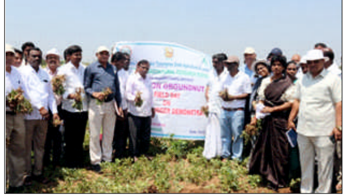
Visit to demonstration plots by QRT team