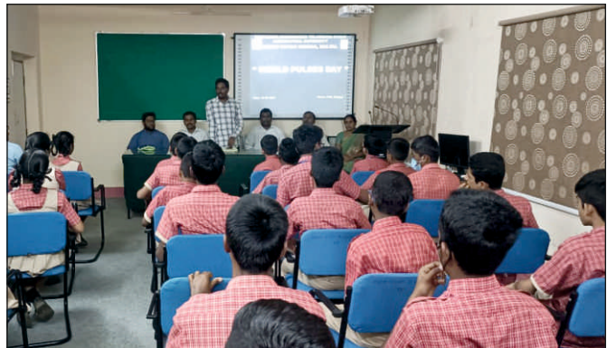
KVK, Malyal creating awareness to school students on importance of pulses on account of World Pulses day on 10 th February, 2023