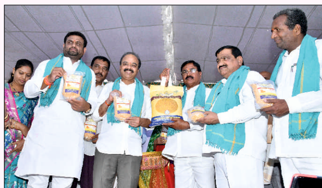
Release of GI tagged Tandur Redgram Dal