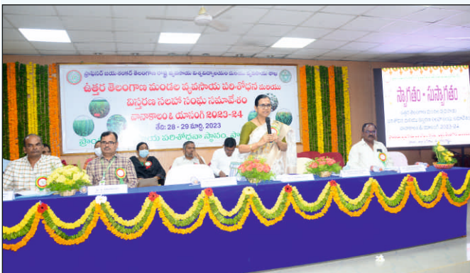
Director of Extension addressing the farmers at ZREAC, Polasa

change. He further added that excess rains in certain districts had an impact on yield with higher incidence of pest and diseases. The farmers, department officials interacted with the scientists and discussed the problems faced during kharif and rabi and on climate changes in their respective zones. Based on the interactive sessions the researchable areas for the ensuing season were drawn. The Associate Directors of Research, Principal Scientists of crops and themes, Scientists, Officials from Agriculture & allied departments and progressive farmers of the respective zones participated in the meetings.