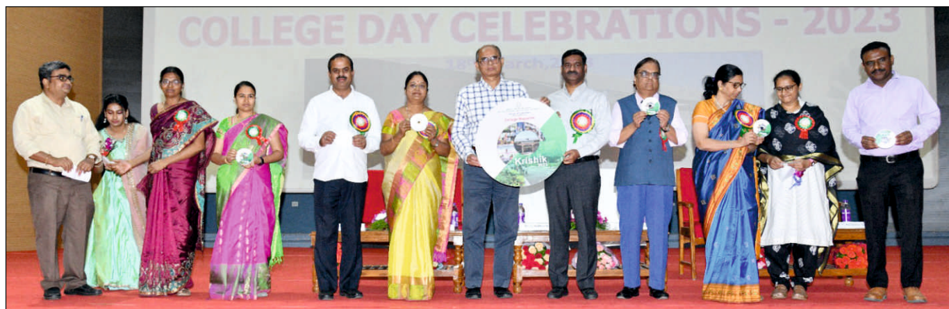
Release of College Magazine at College Day Celebrations of College of Agriculture, Rajendranagar