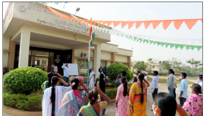
Republic Day Celebrations at Agricultural College, Sircilla