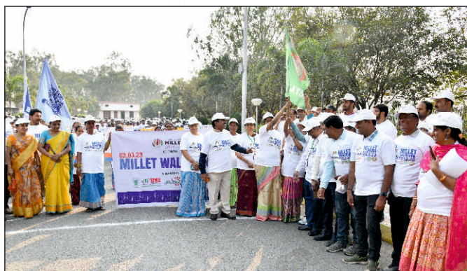
Millet Walkathon-2023 by PJTSAU & ICAR-IIMR