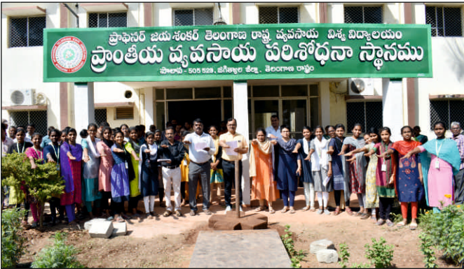
Pledge by students and staff of RARS, Jagtial on account of National Voters' Day on 25 th January, 2023