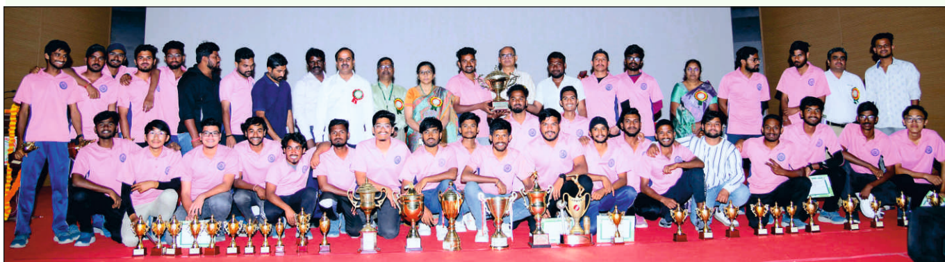
The overall championship winners (Boys) of the Inter college sports meet with the trophy