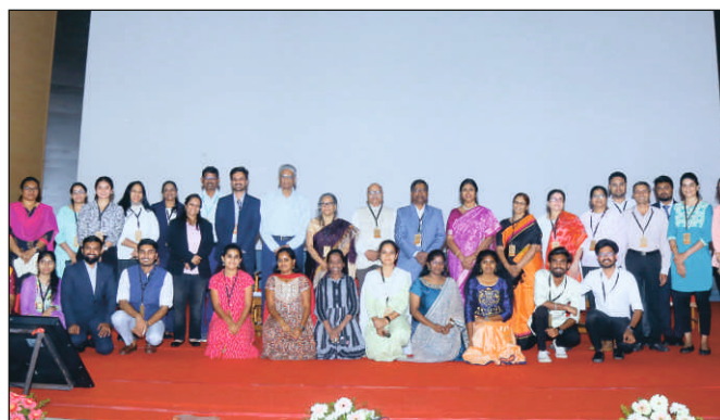
The dignitaries along with students at the workshop