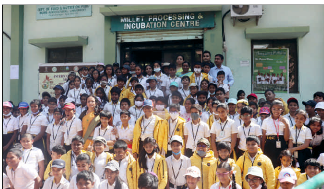
Awareness programme on Millets to school students on the occasion of IYOM by MPIC, PJTSAU

and Incubation Centre of PJTSAU and AICRP on Millets organized several training and awareness programmes to school students, farmers, women etc. Students were oriented on various value added products prepared from millets, need and importance of each millets and their significance. Students were also exposed towards fun games as identifying millets being blindfolded. Live demonstration on primary processing and biscuit preparation was given by using different equipment. Further essay writing competition and cooking competition with millets was organized to students in the context of celebrations of International Year of Millets.