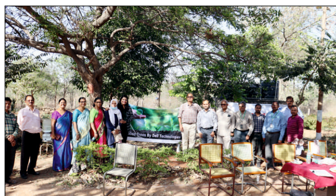
Dignitaries at the Planting Ceremony, Agri. Biodiversity Park, PJTSAU