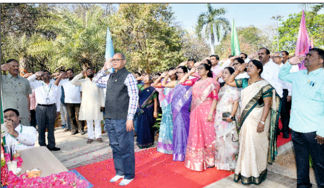
Republic Day Celebrations at Administrative building, PJTSAU