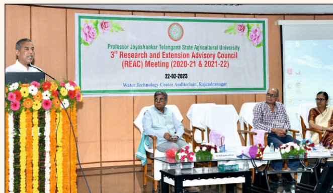
The Hon'ble Vice Chancellor addressing the participants at REAC