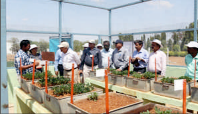
The review team visits research trials