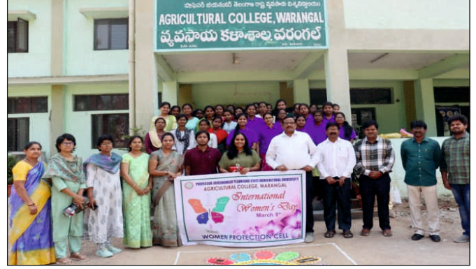
National Voters Day Celebrations and International Women's day Celebrations at Agricultural College, Warangal