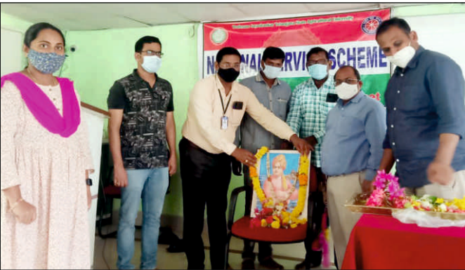
National Youth Day Celebrations at Agricultural College, Aswaraopet