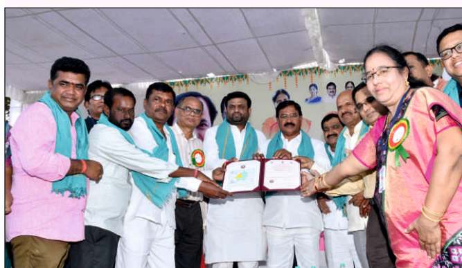
Handing over of GI certificate to the Hon'ble Minister of Agriculture, Telangana