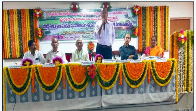
The dignitaries addressing the farmers at ZREAC, Warangal