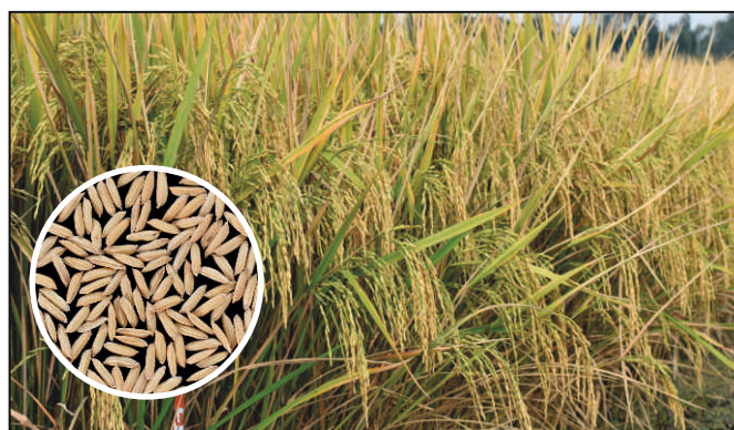
Rajendranagar Vari - 28361 (RNR 28361)