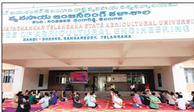
International Yoga Day Celebrations at College of Agricultural Engineering, Sangareddy