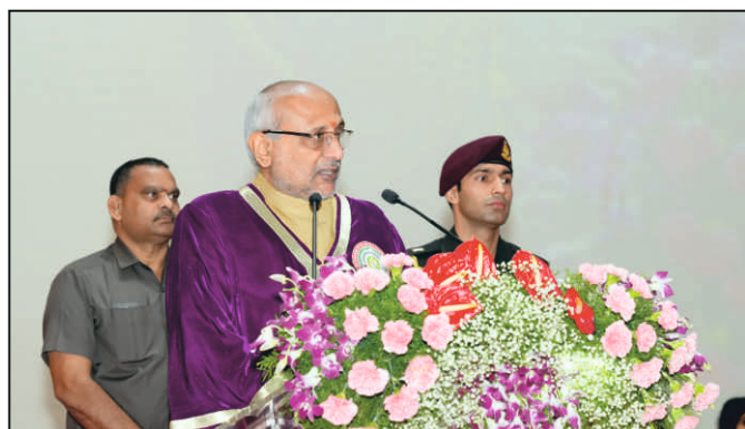
Sri C. P. Radhakrishnan, Hon'ble Governor for the State of Telangana addressing the gathering

The 6 th Convocation of Professor Jayashankar Telangana State Agricultural University (PJTSAU) was held on 10 th June, 2024 at the University Auditorium. The Hon'ble Governor of Telangana and Chancellor of PJTSAU, Sri C.P. Radhakrishnan, presided over the event. He emphasized the crucial role of agriculture in contemporary society, highlighting that agriculture is foundation to all cultures. He encouraged the new graduates to focus on reducing water usage, increasing productivity, and equipping themselves to tackle agricultural challenges to better serve the farming community. He further opined that India, being the most populous country in the world, cannot afford to import food grains and thus utmost priority should be given to the agriculture sector. He reiterated that agri-graduates should utilize innovations in information technology to serve better the farming community.