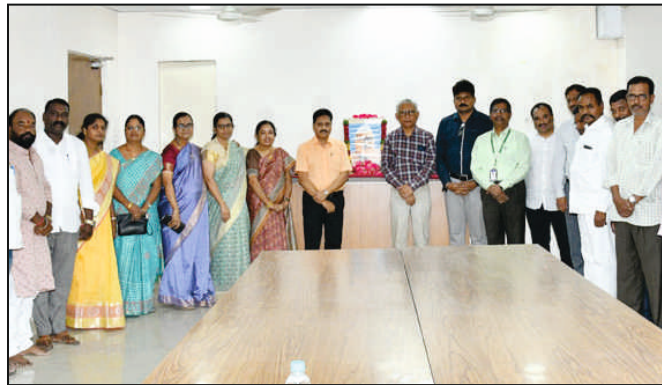
Babu Jagjeevan Ram Birthday Celebrations at Administrative Office