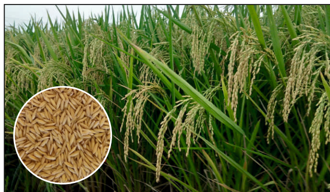
Telangana Rice - 1289 (WGL 1289)