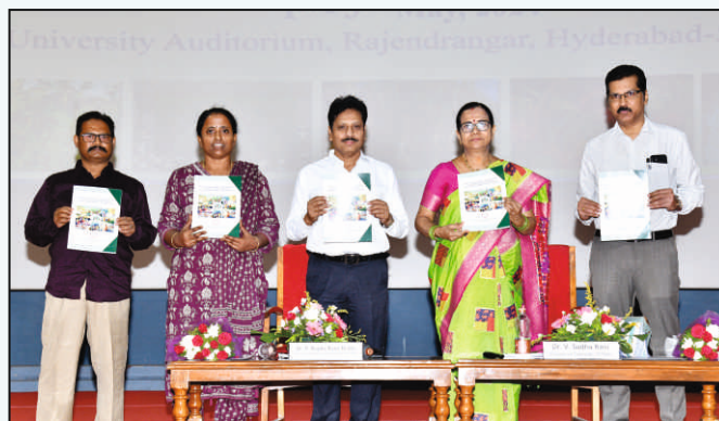
Release of Extension Publication by the dignitaries