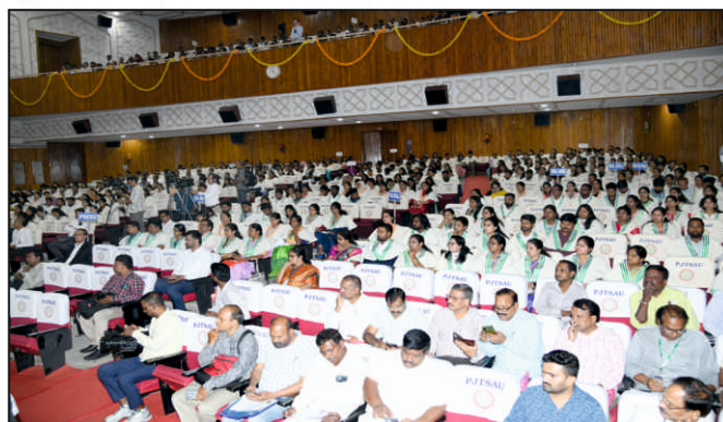
Degree awardee Students at Convocation