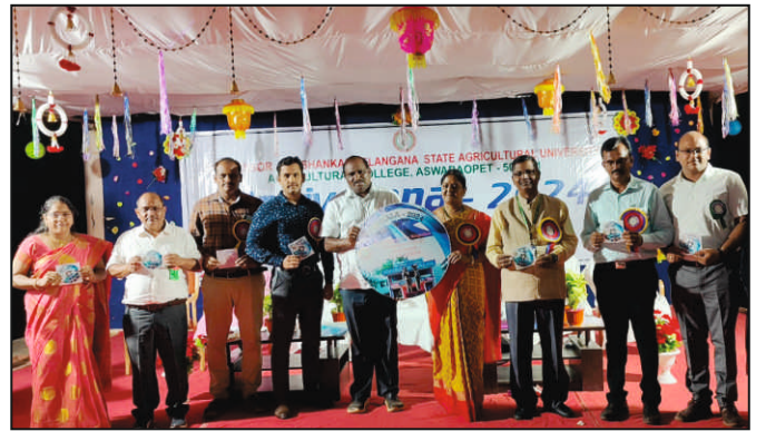
Agricultural College, AswaraoPET