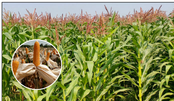
Telangana Makka-3 (DHM 206)