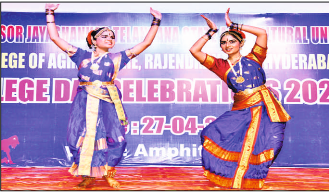
College of Agriculture, Rajendranagar