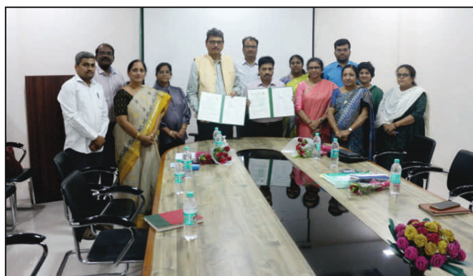
NBPGR and PJTSAU in MoU on Mutual Research and Education