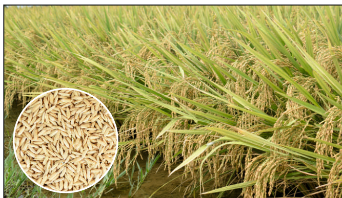
Telangana Rice-7037 (KNM 7037)