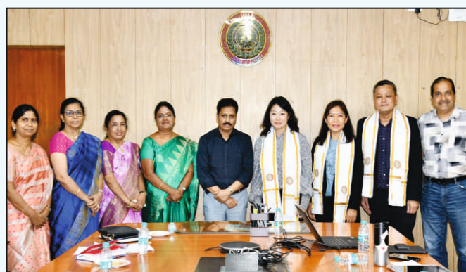
PJTSAU University officers with the team from Mae Fah Luang University, Thailand