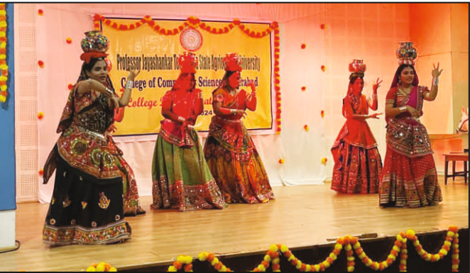
College of Community Science, Saifabad