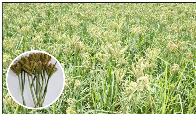
Palem Ragi - 38 (PRS 38)