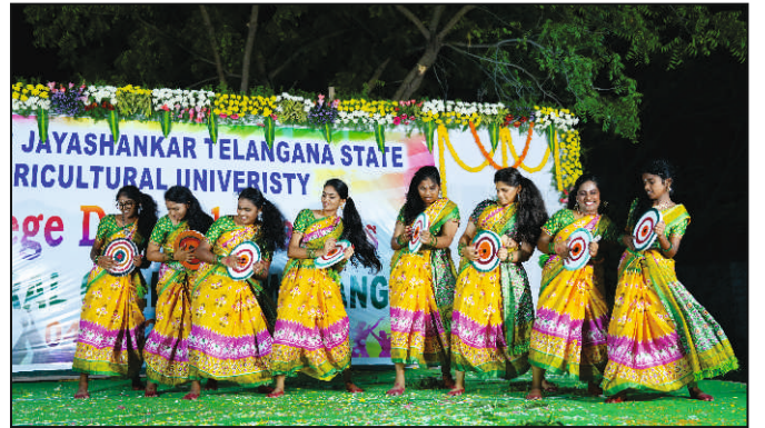
Agricultural College, Warangal