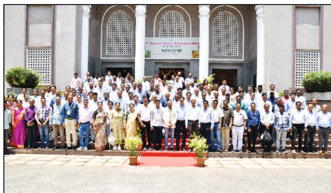
Delegates participated in Maize Workshop

also suggested using genomic selection to combine many traits simultaneously. A special brainstorming session on "Road map for increasing maize production to address E30" was conducted and experts from research, private sector