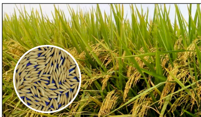
Warangal Vari - 1119 (WGL 1119)