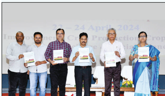
Release of Research booklet by the dignitaries