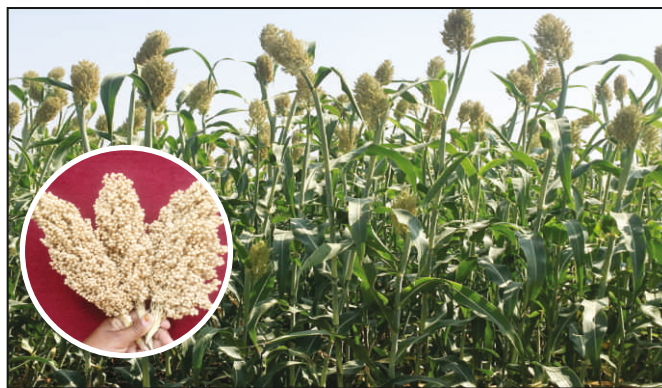
Tandur Jonna-55 (SVT 55)