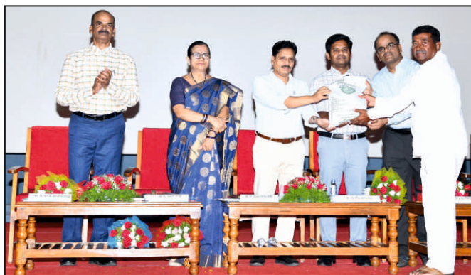
The Dignitaries distributing seed to farmers at Seed mela