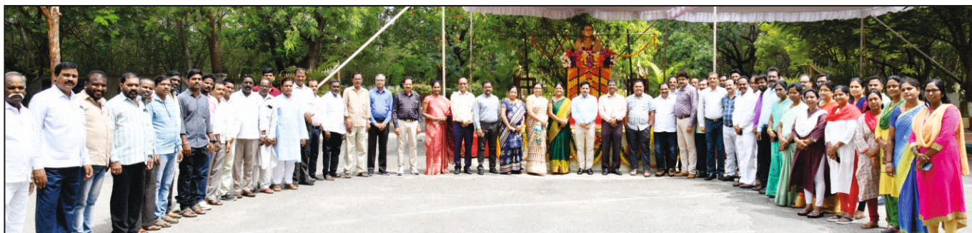
Paying tributes to Professor Jayashankar on his death anniversary at Administrative Office