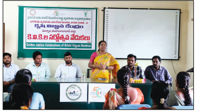
Golden Jubilee Celebrations of KVKs at KVK, Kothagudem and KVK, Malyal