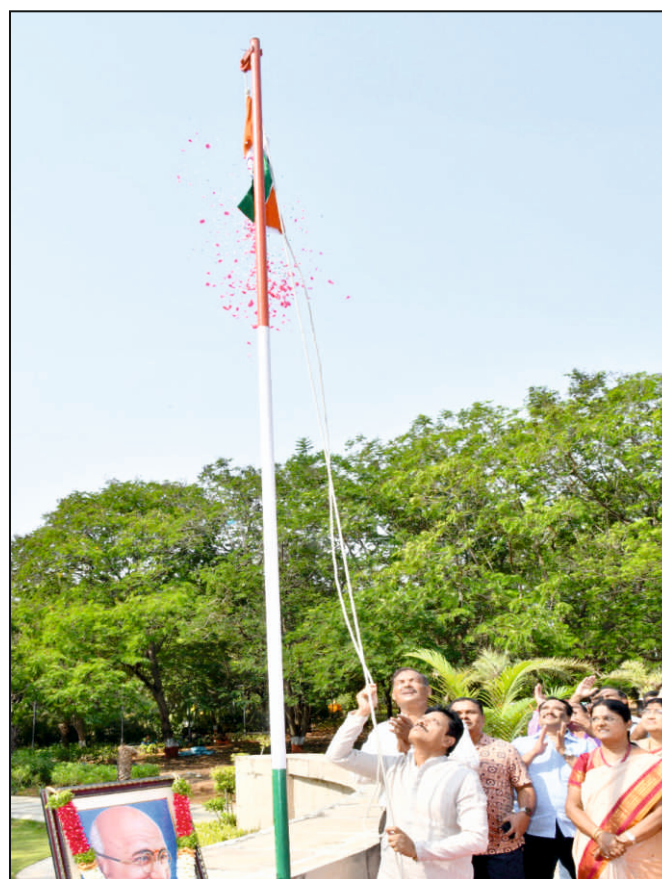
Telangana State Formation day Celebrations at Agricultural College, Sircilla and Administrative Office, PJTSAU