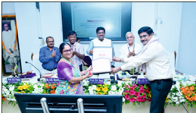
Centre on AICRP-Weed Management receiving the Best Centre award