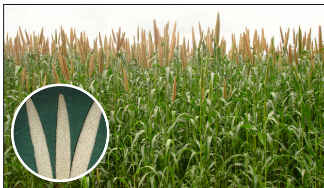
Palem Sajja-1625 (PBH 1625)