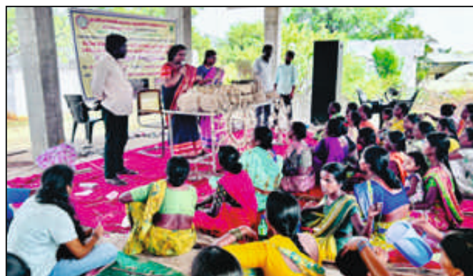
Faculty of Community Science imparting technical know-how to the trainees

training program helped the participants to acquire skills in making cane and bamboo products, enabling them to generate income by establishing their own enterprises.