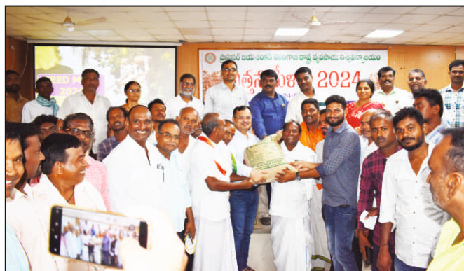
Seed distribution at Seed mela at RARS, Jagtial

Stalls were arranged for sale of seed and value added products along with demonstrations on various modern agro technologies. Besides PJTSAU, Sri Konda Laxman Telangana State Horticultural University (SKLTSHU), P.V.Narsimha Rao Telangana Veterinary University (PVNTVU), ICAR institutes, Dept. of Agriculture, National Seeds Corporation (NSC), Telangana State Seed Development Corporation (TSSDC) and Telangana State Seed and Organic Certification Agency (TSSOCA) participated in the event.